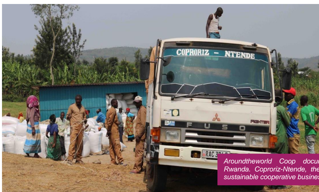
Aroundtheworld Coop documentary in Rwanda. Coproriz-Ntende, the story of a sustainable cooperative business.

The ARM usually aims at bringing together the ICA-EU staff together to discuss the concluded year, exchange on the pillars of their work, network groups training and deliberate on the next year’s action plan.