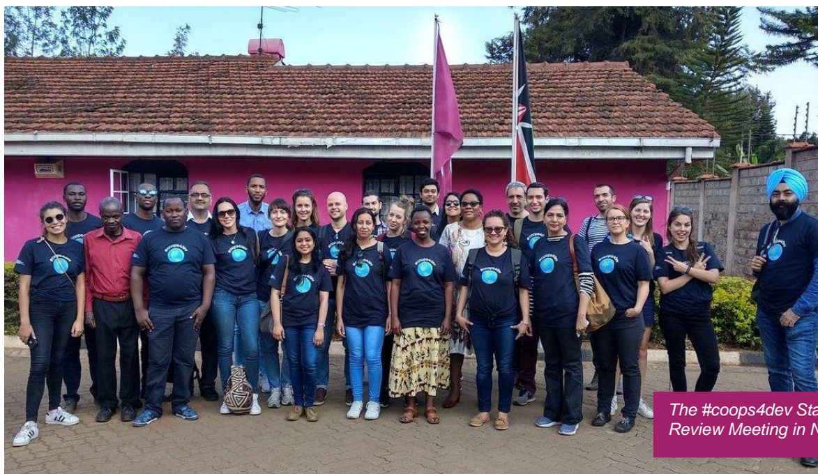
The #coops4dev Staff Annual Review Meeting in Nairobi.

The #coops4dev staff met in Nairobi Kenya for their Annual Review Meeting (ARM) that took place from the 4 th – 8 th march, 2019 at The Cooperative University of Kenya. This was the 3 rd meeting and the first of its kind to be held in Africa since the inception of ICA-EU partnership project entitled “Co-