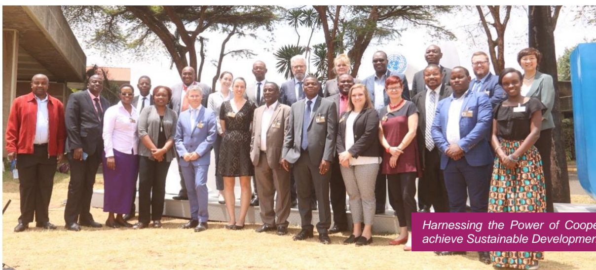
Harnessing the Power of Cooperatives to achieve Sustainable Development for all.

With the theme, “the future is now, youth are not too young to lead” , the youth once again called for active engagement and participation in policy and decision making processes at national, regional and continental levels and debated on youth development matters with particular focus on the inclusion and representation of young people in governance (civil, economic and political), peace and security and migration.