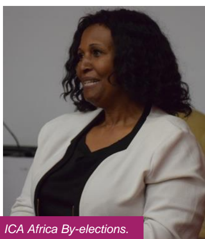
ICA Africa By-elections.

ICA Africa held a by-election during its members' forum held on the 11 th October, 2019 in Rwanda. There were seven vacant positions – one position for the women representative to the regional board, one position for the member at large for the regional board and five positions for trustee members.