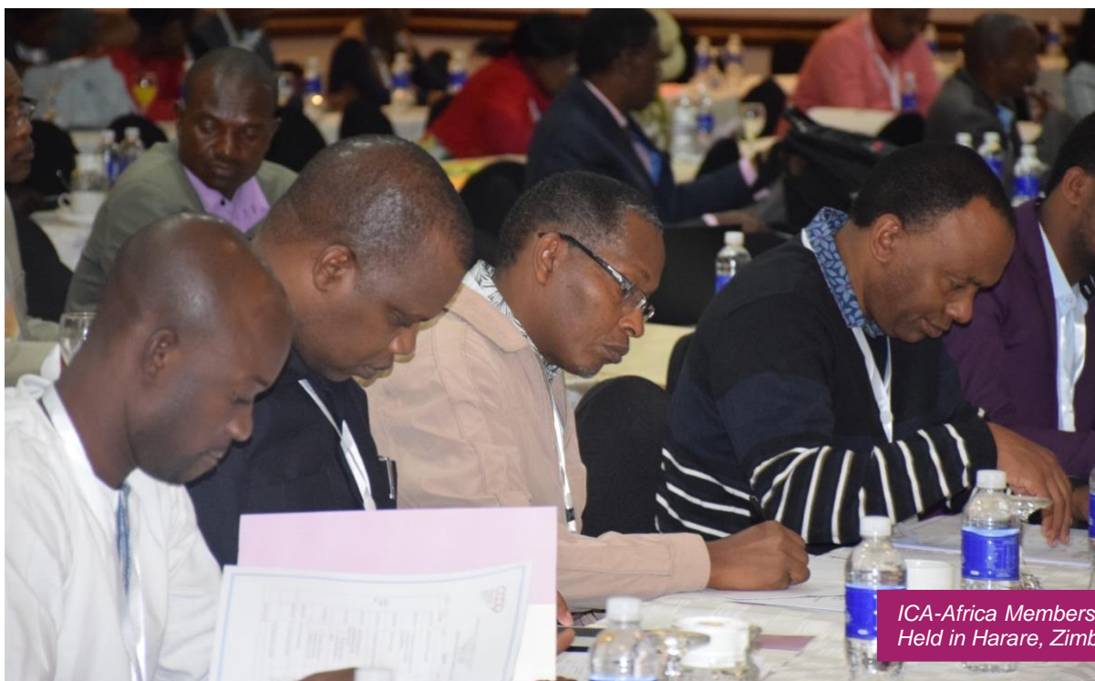
ICA-Africa Members Forum Held in Harare, Zimbabwe.