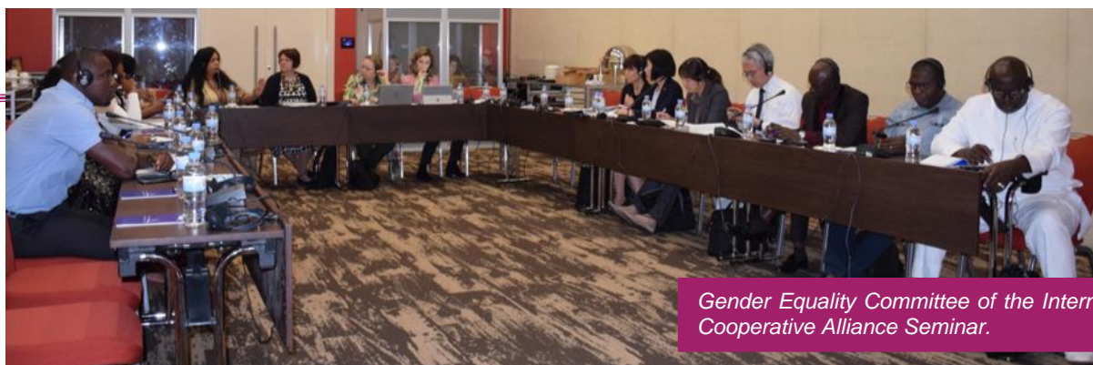
Gender Equality Committee of the International Cooperative Alliance Seminar.

The Gender Equality Committee of the International Cooperative Alliance (ICA-GEC) organized a seminar themed cooperatives and feminism in the 21 st century on the 12 th October, 2019. Gender equality is an agenda that most cooperatives are promoting around the world as evidenced from some of the case studies shared during the seminar.