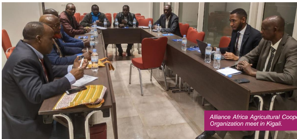
Alliance Africa Agricultural Cooperatives Organization meet in Kigali.