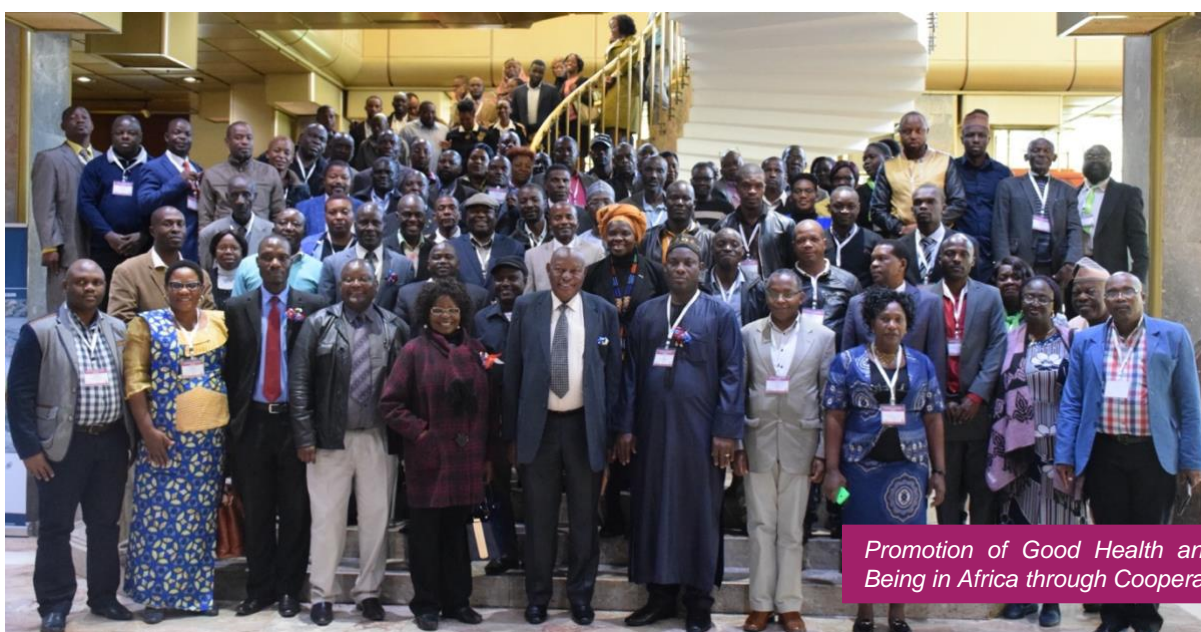
Promotion of Good Health and Well Being in Africa through Cooperatives.

agenda, share, exchange and build consensus on measures to be taken. The members' forum was held on 29 th during the 6 th Technical Committee of the Africa Ministerial Cooperative Conference in Zimbabwe.