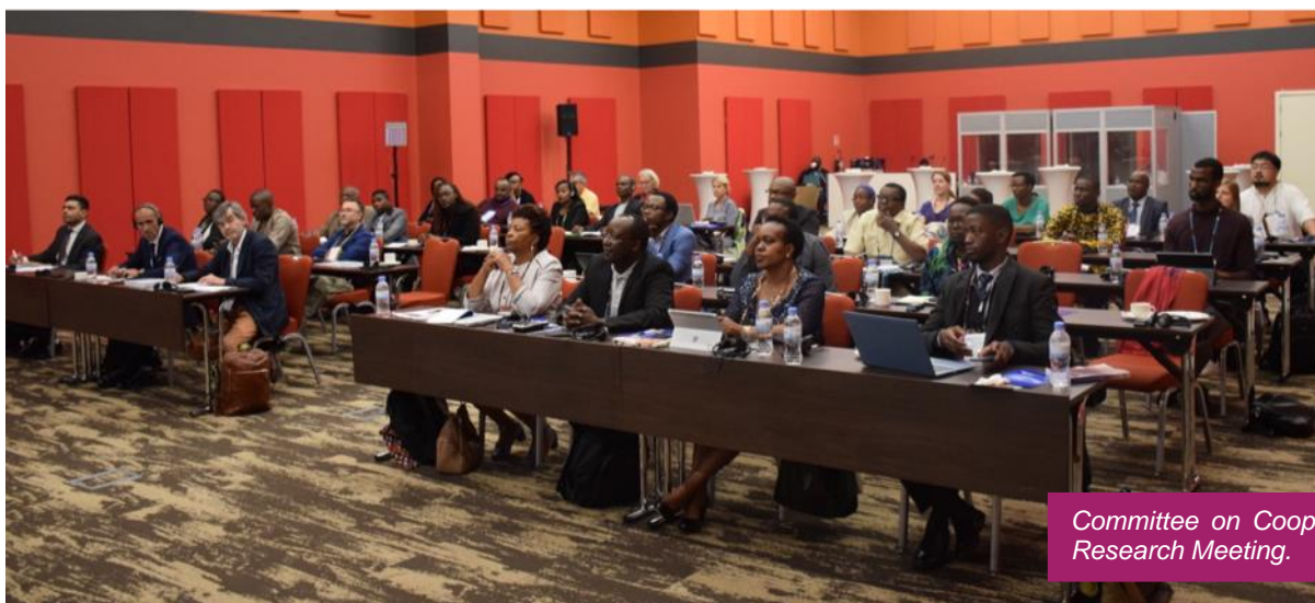
Committee on Cooperative Research Meeting.

Research is a powerful tool for improving people's lives. On 14 th October, 2019 in Rwanda, researchers and cooperative movement leaders together with stakeholders from different countries met to discuss the current situation of cooperative research in