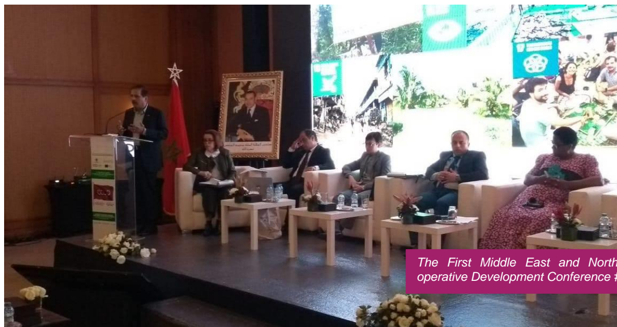
The First Middle East and North Africa Co-operative Development Conference #MENACDC.

ICA-Africa and ICA-Asia and Pacific jointly organized for a Cooperative Development Conference (CDC) focusing on cooperatives and stakeholders in the