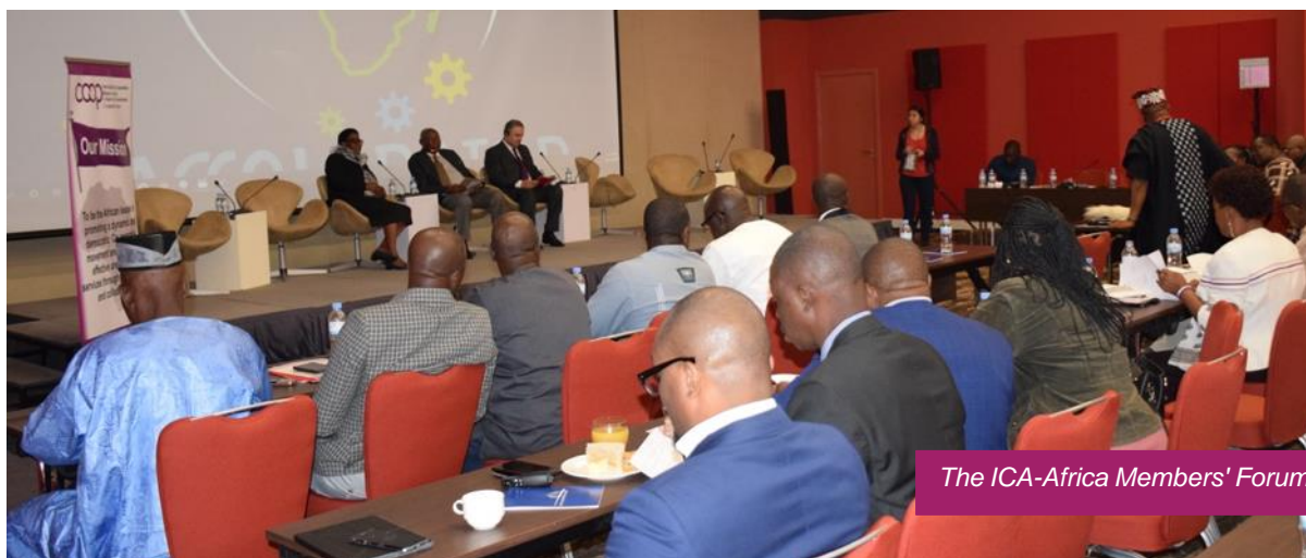
The ICA-Africa Members' Forum in Kigali.

The ICA Africa held a Members' Forum on 11 th October, 2019 in Kigali -Rwanda. During the forum, the Cooperative Resource Information Management Solutions (CRIMS) was presented to the members as well as the Alternative Dispute Resolution for Cooperative (ADRC). The regional by-elections were also held during this forum.