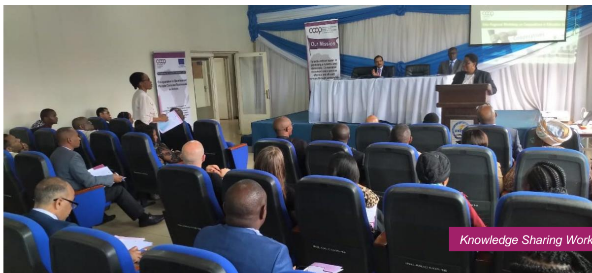
Knowledge Sharing Workshop.