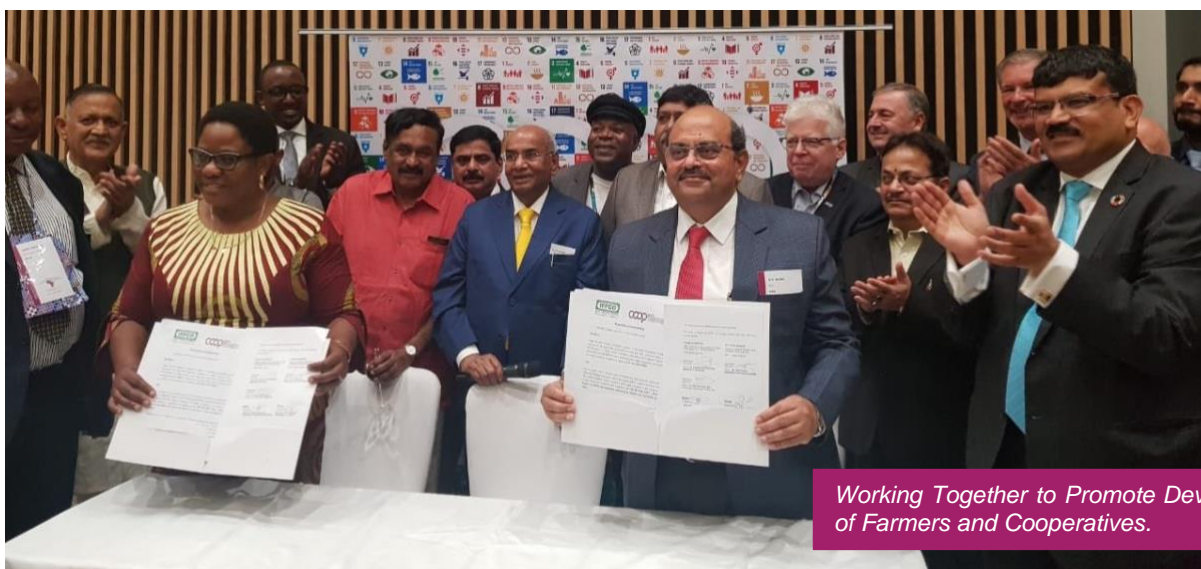
Working Together to Promote Development of Farmers and Cooperatives.

Africa, the future agenda for developing research and collaboration between the research community and the cooperative movement in the Africa region and exploring ways of re-energizing the committee on cooperative research Africa network.