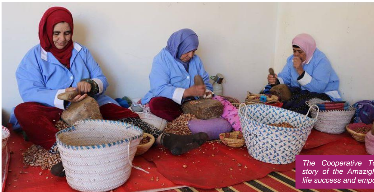
The Cooperative Toudarte: a story of the Amazigh women's life success and empowerment.

Coopérative toudarte (Berber women of Coopérative toudarte) documentary done by Aroundtheworld.coop (photo credit) is here . A cooperative in Morocco with women working on Argania spinosa seeds