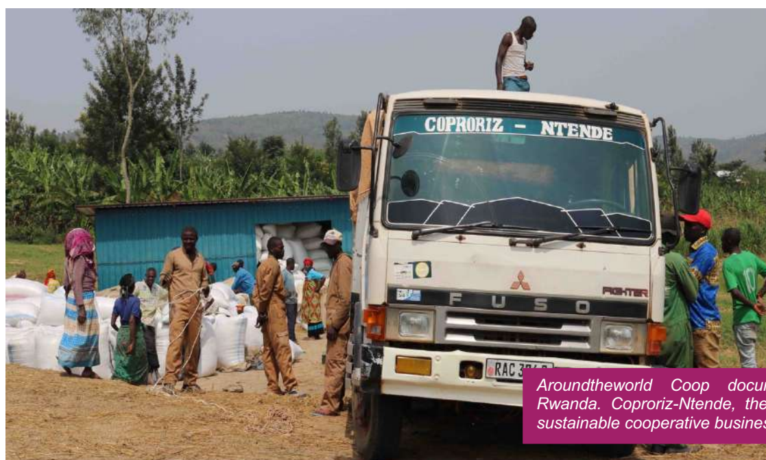
Aroundtheworld Coop documentary in Rwanda. Coproriz-Ntende, the story of a sustainable cooperative business.

The ARM usually aims at bringing together the ICA-EU staff together to discuss the concluded year, exchange on the pillars of their work, network groups training and deliberate on the next year’s action plan.