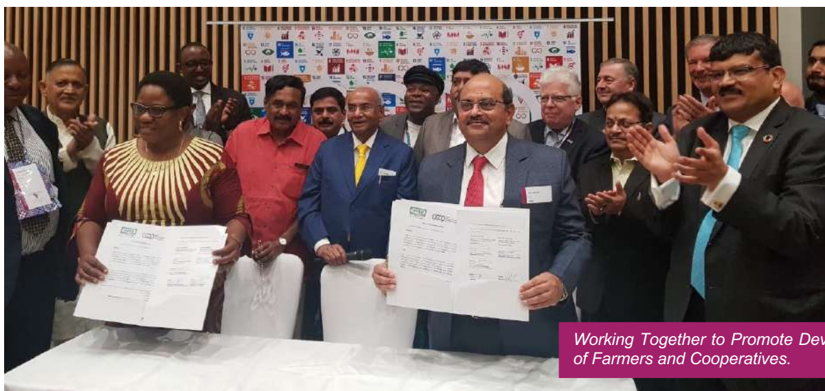
Working Together to Promote Development of Farmers and Cooperatives.

Africa, the future agenda for developing research and collaboration between the research community and the cooperative movement in the Africa region and exploring ways of re-energizing the committee on cooperative research Africa network.