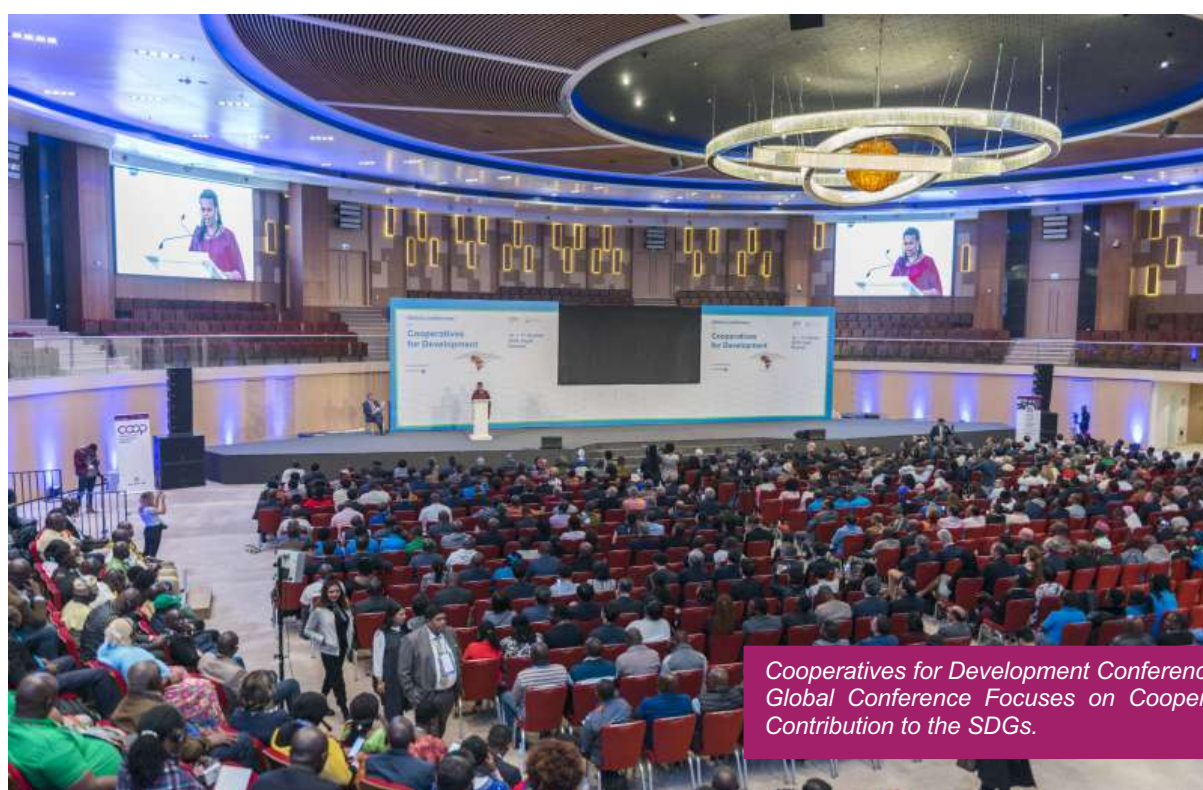
Cooperatives for Development Conference: ICA Global Conference Focuses on Cooperatives' Contribution to the SDGs.

More than 1,000 participants from 94 countries met in Kigali- Rwanda from 14 th – 17 th October, 2019 for the ICA's Global Conference 'Cooperatives for Development'. Read More.