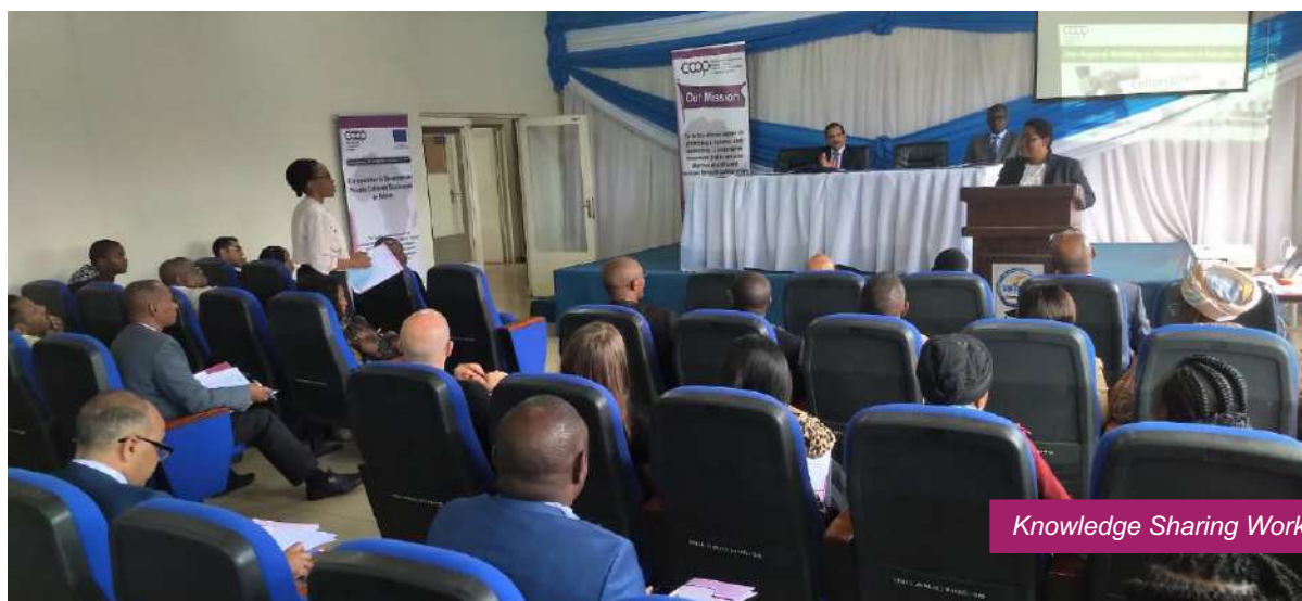
Knowledge Sharing Workshop.