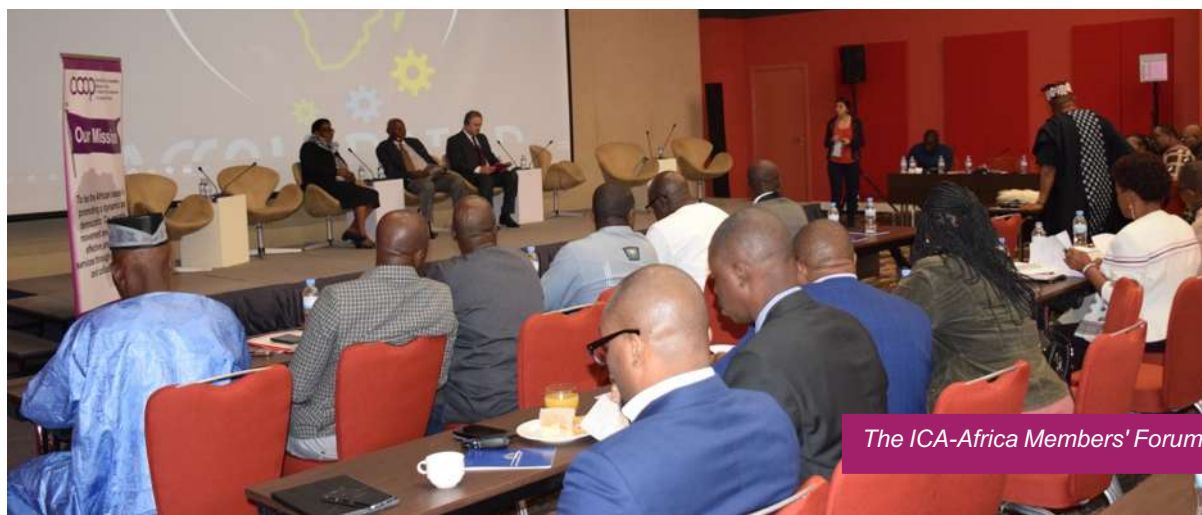
The ICA-Africa Members' Forum in Kigali.

The ICA Africa held a Members' Forum on 11 th October, 2019 in Kigali -Rwanda. During the forum, the Cooperative Resource Information Management Solutions (CRIMS) was presented to the members as well as the Alternative Dispute Resolution for Cooperative (ADRC). The regional by-elections were also held during this forum.