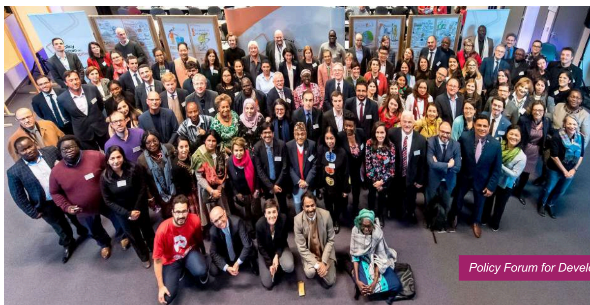
Policy Forum for Development.

Catch more on the COOPRORIZ-Ntende impressive and innovative sustainable business from here .