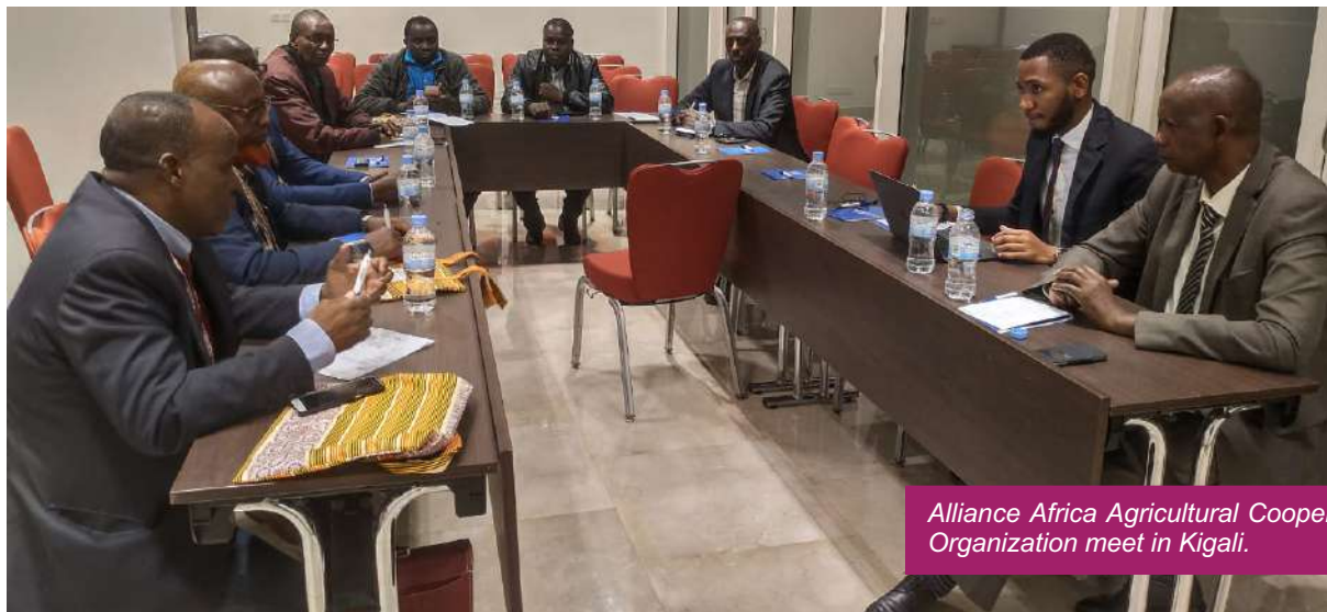
Alliance Africa Agricultural Cooperatives Organization meet in Kigali.