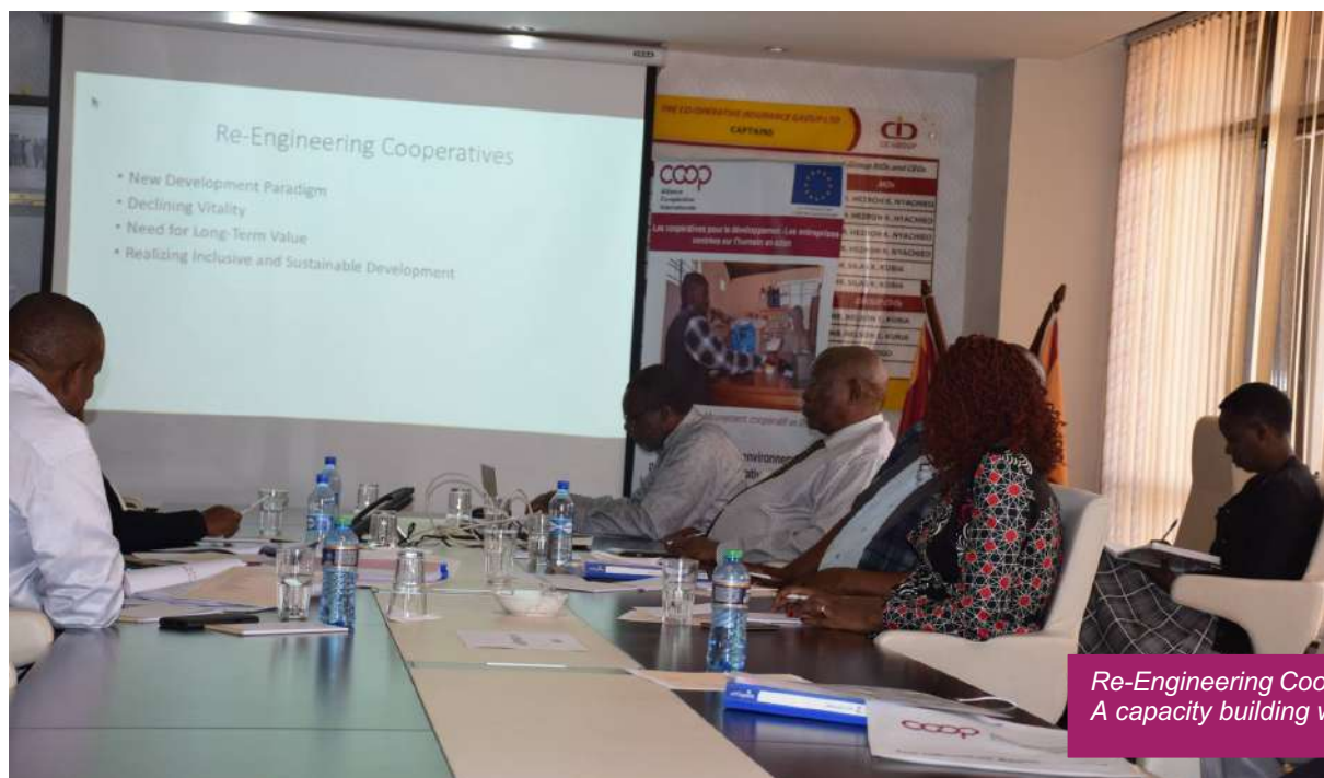
Re-Engineering Cooperatives – A capacity building workshop.

women from both sides – survivors and perpetrators - make their living by producing crafts and build a future of unity by working together. Find here the full report .