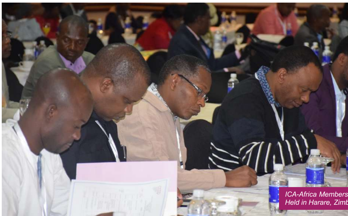
ICA-Africa Members Forum Held in Harare, Zimbabwe.