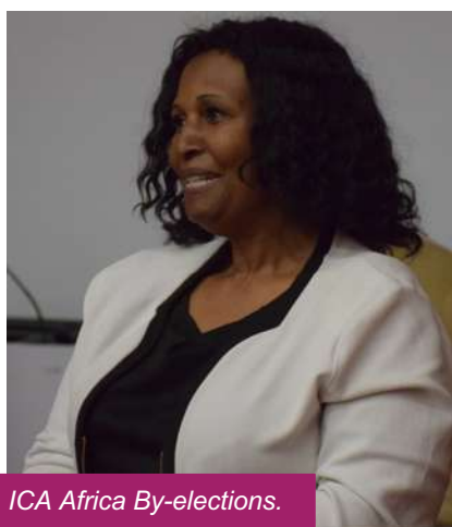
ICA Africa By-elections.

ICA Africa held a by-election during its members' forum held on the 11 th October, 2019 in Rwanda. There were seven vacant positions – one position for the women representative to the regional board, one position for the member at large for the regional board and five positions for trustee members.