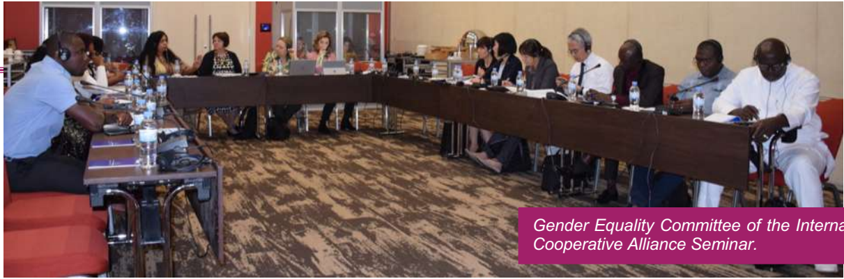
Gender Equality Committee of the International Cooperative Alliance Seminar.

The Gender Equality Committee of the International Cooperative Alliance (ICA-GEC) organized a seminar themed cooperatives and feminism in the 21 st century on the 12 th October, 2019. Gender equality is an agenda that most cooperatives are promoting around the world as evidenced from some of the case studies shared during the seminar.