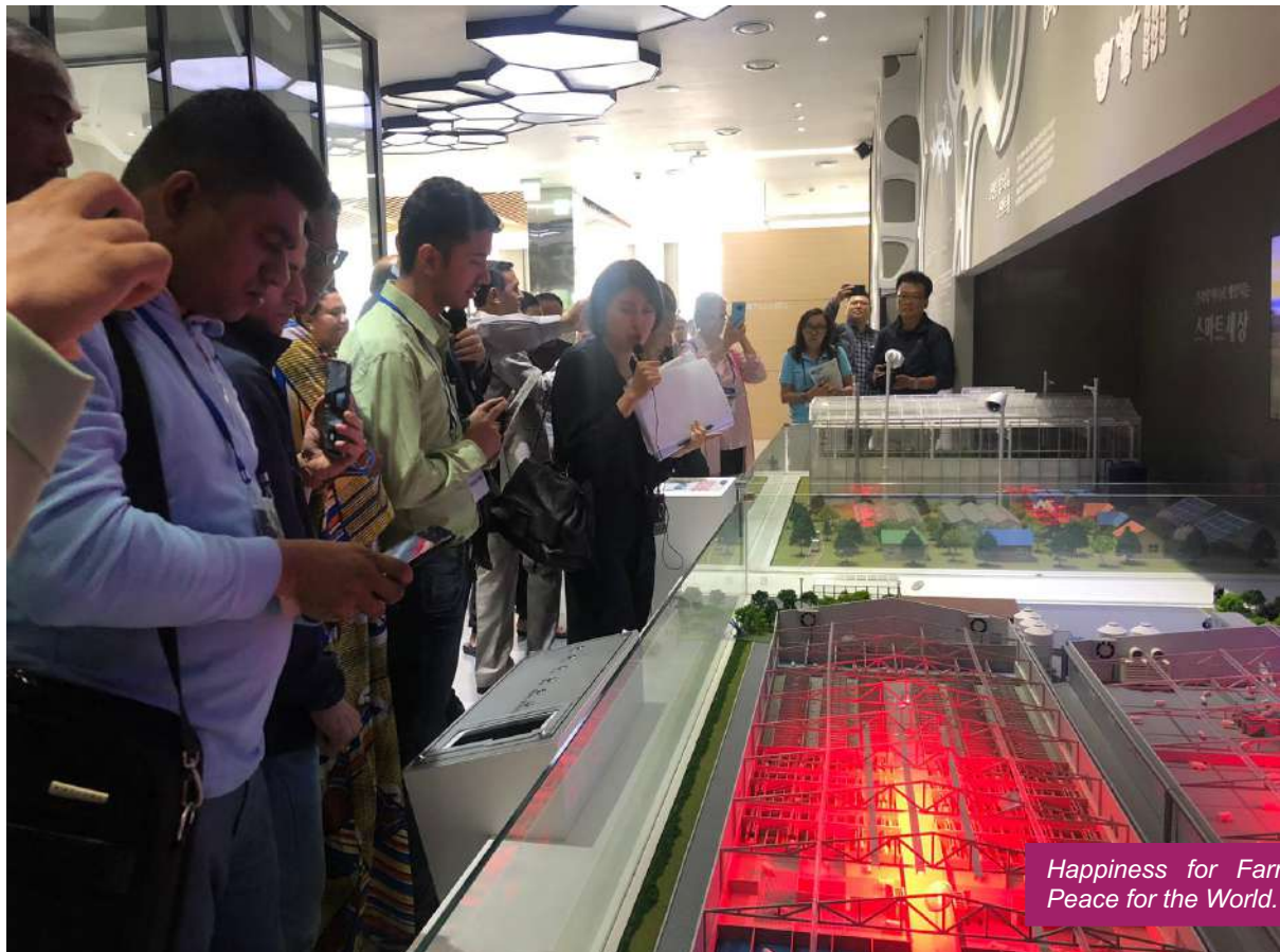
Happiness for Farmers, Peace for the World.

Tokyo - Japan. The joint study tour encourages exchange of knowledge and experiences as well as exploring possible cooperation between African and Japanese cooperatives. This year's study tour edition saw participation of cooperative leaders from Kenya, Nigeria and Tanzania.