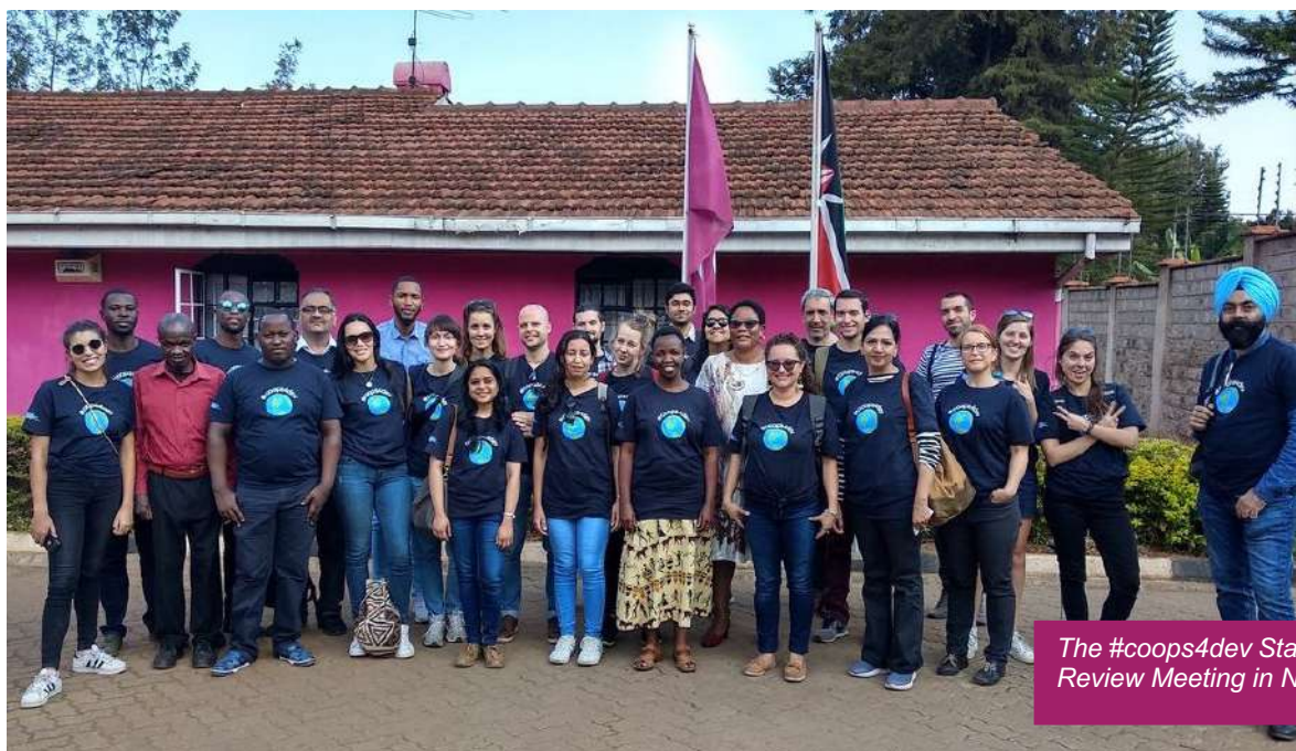
The #coops4dev Staff Annual Review Meeting in Nairobi.

The #coops4dev staff met in Nairobi Kenya for their Annual Review Meeting (ARM) that took place from the 4 th – 8 th march, 2019 at The Cooperative University of Kenya. This was the 3 rd meeting and the first of its kind to be held in Africa since the inception of ICA-EU partnership project entitled “Co-