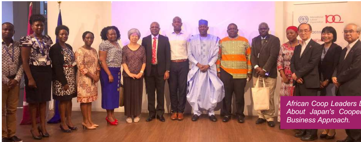
African Coop Leaders Learn About Japan's Cooperative Business Approach.

Japanese Consumers' Cooperative Union (JCCU) and the International Labour Organization (ILO), through its Cooperatives Unit (COOP) and its Office for Japan (ILO Tokyo), organized for the 10th edition of the ILO-JCCU African Cooperative Leaders' Study Tour that took place from 6-14th September, 2019 in