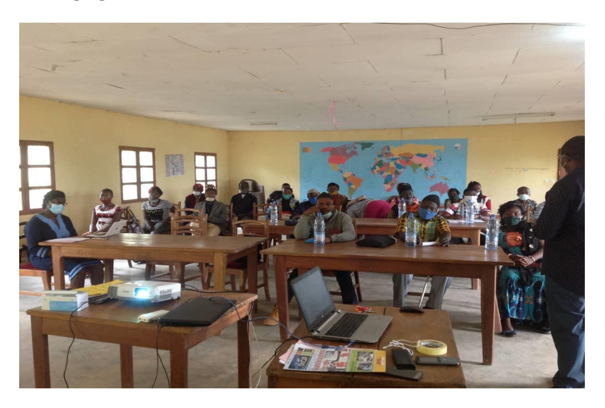
Picture: ENOFOCC networking and sensitization meeting with local farmers

They have shown interest in our product through the sensitization campaigns we run.