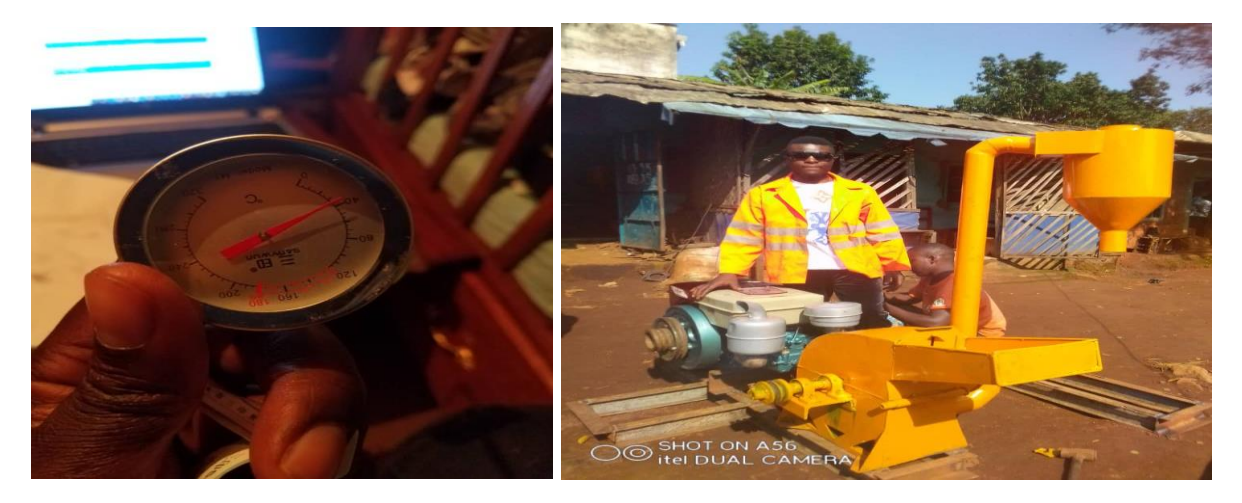
Picture: Some equipments of ENOFOCC Cameroon (Probe thermoter & Crusher Machine)

For its proper organic manure processing, and thanks to grants from its funder, ENOFOCC Cameroon has been able to aquire an electric manure crusher machine, probe thermometer, handcarts, spades and other processing equipments